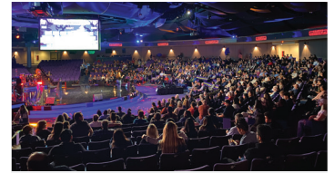
Anaheim Confidential is a fundraiser where APD Homicide Detectives give a true-crime presentation of an Anaheim homicide case. Proceeds go to supporting the community's non-profit Cops for Kids | APAL (C4K).