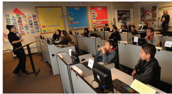
Public Safety Pipeline at Sycamore Junior High School, is class that teaches students about careers in Public Safety, emphasizing character building, public service, communication, and teamwork.