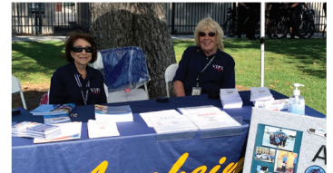
Volunteers in Police Service (VIPS) provide volunteer support to aid police personnel in the delivery of services to the citizens of Anaheim by supplementing existing departmental services.