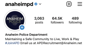
Anaheim Police Department Maintaining a Safe Community to Live, Work & Play #JoinAPD Email us at APDRecruitment@Anaheim.net @AnaheimPD social media platforms enhance public safety education and awareness. Follow us on Facebook, Instagram, YouTube, and X!