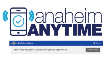
Anaheim Anytime is an online service providing the community the ability to share problems, issues or other concerns they see in their neighborhood or around the city 24 hours a day, seven days a week.