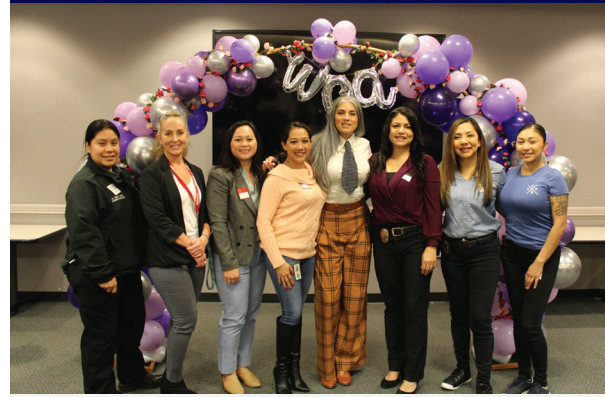
Women of APD was founded in 2023 by a team of sworn and civilian staff. It is a branch of Anaheim PD's Peer Support program concentrating on the well being and mental health of the department's women.