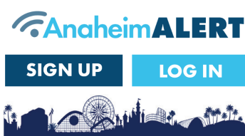
Anaheim Alerts is a notification system used to contact you during urgent or emergency situations with useful information and updates. Sign up at Anaheim.net .