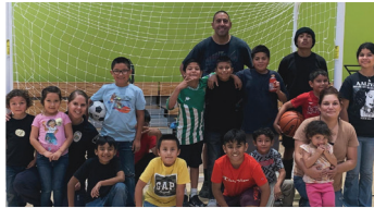
The Anaheim Safe Schools program places School Resource Officers in middle schools and high schools to ensure safe campuses and to enhance relationships between our youth and law enforcement.