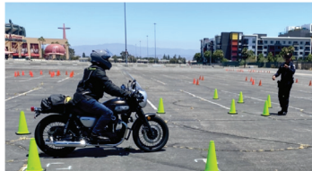
Coppers & Cycles is a quarterly motorcycle safety event hosted by APD Traffic Motor Instructors to help motorcycle riders enhance their riding skills and lead them to become more confident, safer riders.