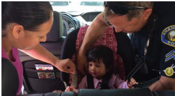
The Car Seat Check-Up is a recurring event where APD Traffic Officers install and inspect child car seats for child passenger safety.