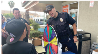
Coffee With A Cop events are held at local businesses, where residents have the opportunity to casually build relationships with officers who work and have knowledge of what goes on in their area.