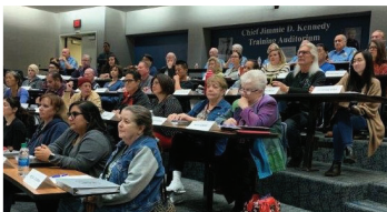
PACE (Public Awareness through Citizen Education) is a 14-week course designed to teach citizens about the philosophy, policies and principles of law enforcement.