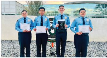
The Explorer Program offers Anaheim's youth, between the ages of 14 and 21, the opportunity to be involved in community activities, make new friends, and gain valuable knowledge.